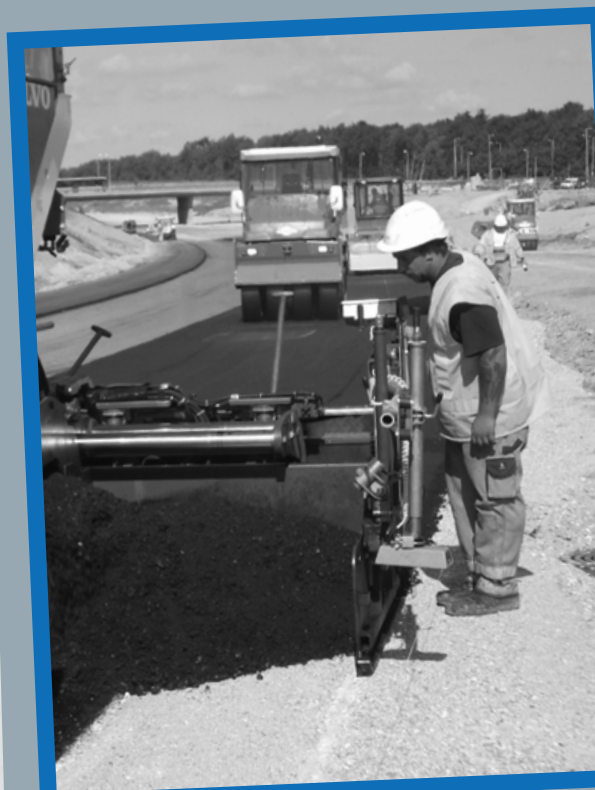
Mini-Line® HS301 Grade Control Kit with G224 on a stringline