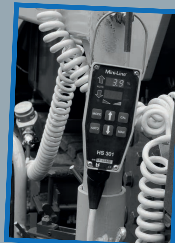
Mini-Line® HS301 Handset