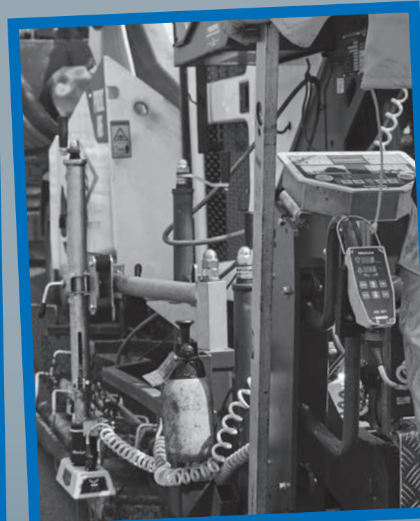
Mini-Line® HS301 Grade Control Kit with G224