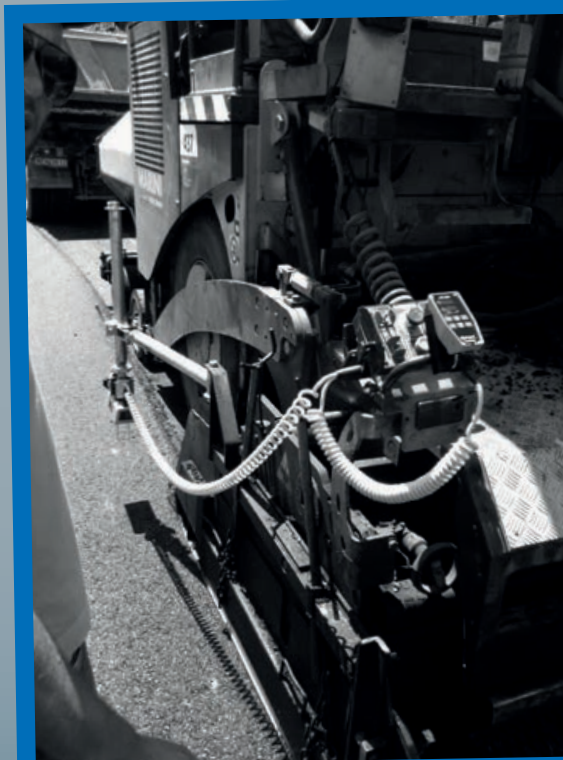
Mini-Line® HS301 Grade Control Kit with G224